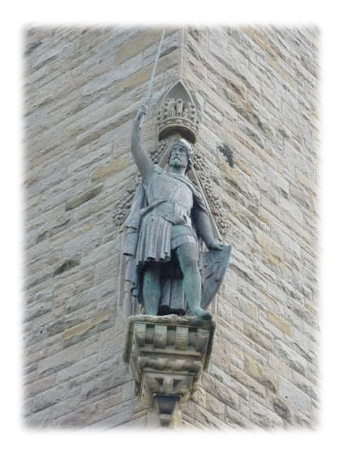
Sir William Wallace

The third and comprehensive architectonic point to be grasped is this: Communism and Mohammedanism are religions of evil. Their twin facilitating ideologies of diversity and multiculturalism have compromised the Force Security of United States Armed Forces and the National Security of the United States of America. An insecure Army is no Army. A Nation with an insecure Army is not a Nation, it is a killing zone.