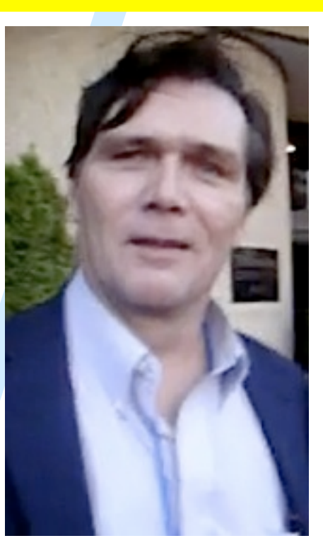
Restart The US Constitution